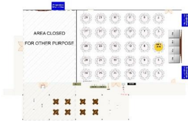
(max 30+2 tables)