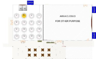
(max 16+1 tables)