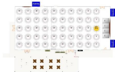
(max 50+2 tables)