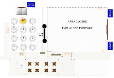
(max 12+1 tables)