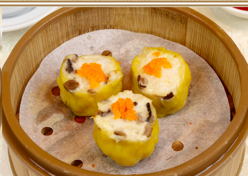
鱼籽烧卖 Siu Mai