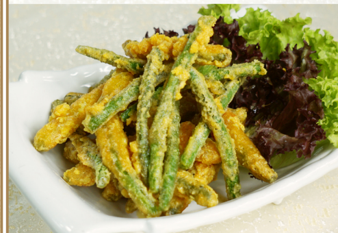
咸蛋四季豆 Crispy Green Bean w/ Salted Egg Yolk