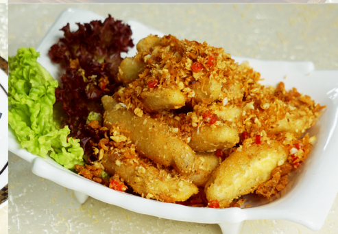
鸡松炸茄子 Crispy Brinjal with Chicken Floss