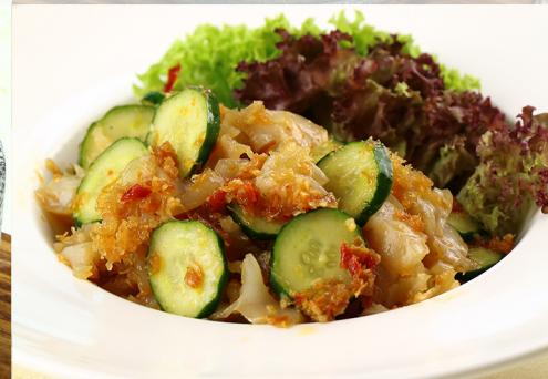
极品酱青瓜海蜇头 Jellyfish with Cucumber & XO Sauce