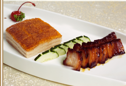
烧味双拼 BBQ Combo Platter