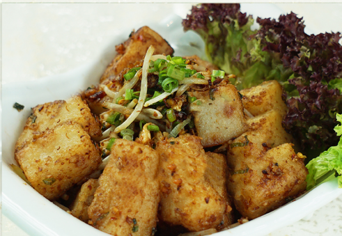
極品醬炒萝卜糕 Stir-Fried Radish Cake with X.O. Sauce