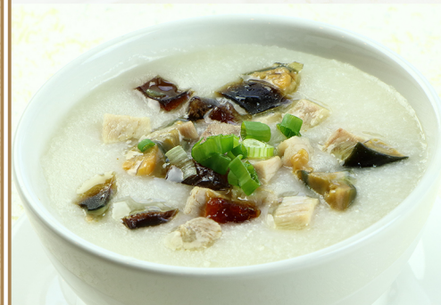
皮蛋瘦肉粥 Century Egg & Minced Pork Porridge