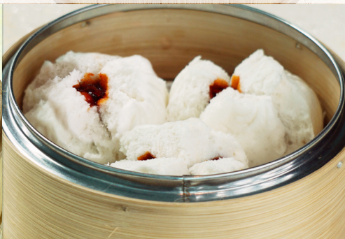
叉烧包 BBQ Pork Bun