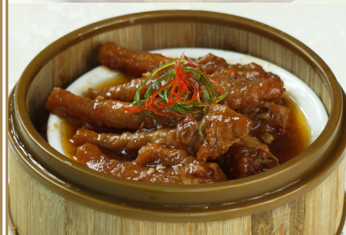
豉汁蒸凤爪 Chicken Feet with Black Bean Sauce