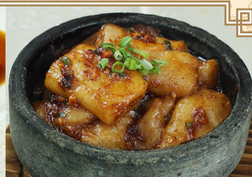
極品醬煎肠粉 Pan-Fried Rice Roll with X.O. Sauce