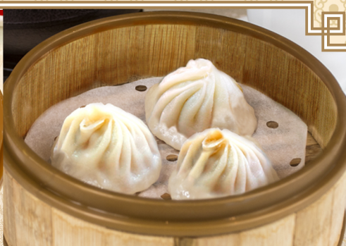
小笼包 Xiao Long Bao