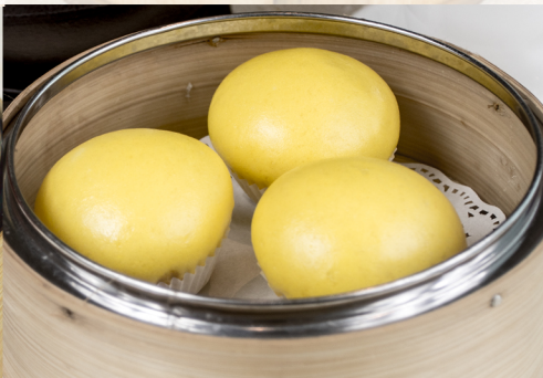
流沙包 Runny Custard Bun