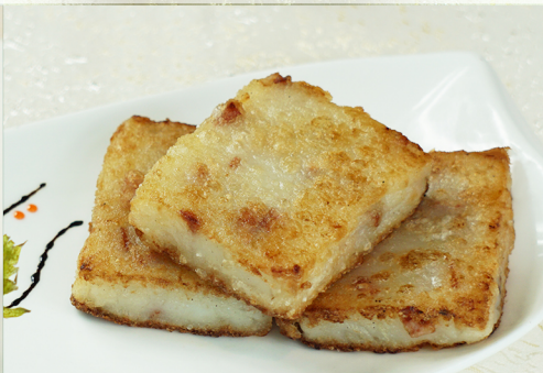
香煎萝卜糕 Pan-Fried Radish Cake