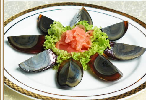
皮蛋酸姜 Century Egg with Pickled Ginger