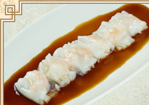
鲜虾肠粉 Steamed Rice Roll with Prawn