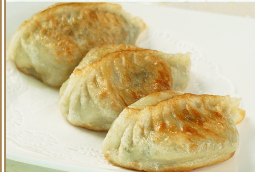
锅贴 Pan-Fried Meat Dumpling