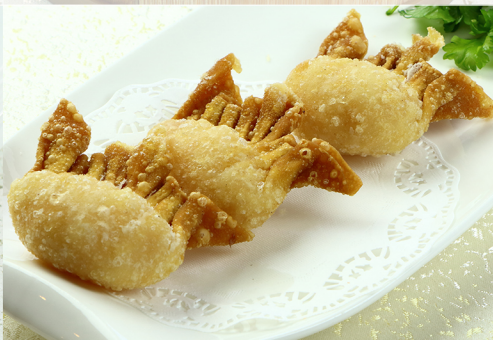
沙律明虾角 Crispy Prawn Dumpling