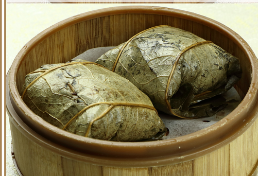
珍珠鸡 Glutinous Rice in Lotus Leaf