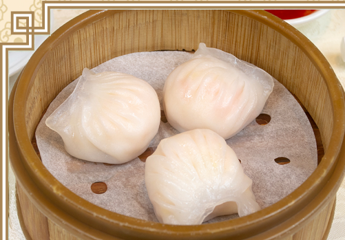
水晶虾饺 Crytal Prawn Dumpling