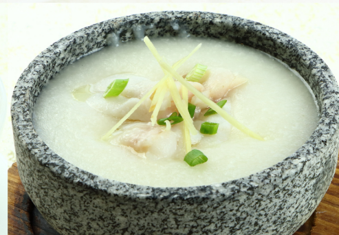
生滚龙趸球粥 Giant Garoupa Porridge