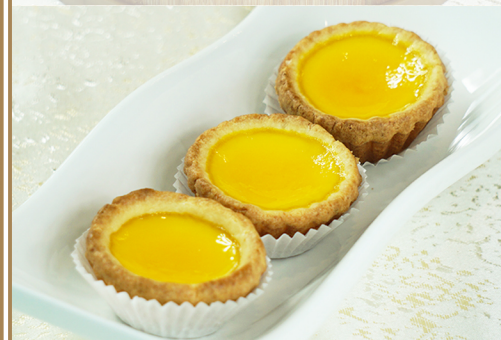
迷你蛋挞 Mini Egg Tart