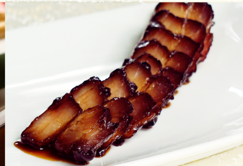
港式蜜汁叉烧 Honey Glazed BBQ Pork