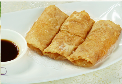
鲜虾腐皮卷 Crispy Beancurd Skin Prawn Roll