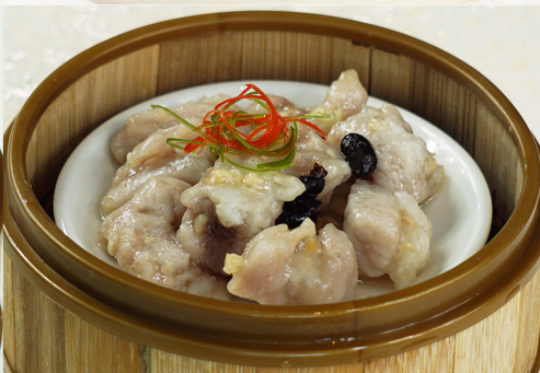
豉汁蒸排骨 Pork Rib with Black Bean Sauce