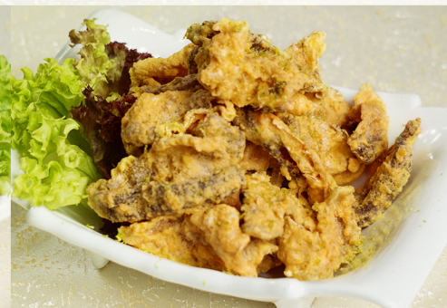
柠香金沙鱼皮 Crispy Fish Skin with Salted Egg Yolk