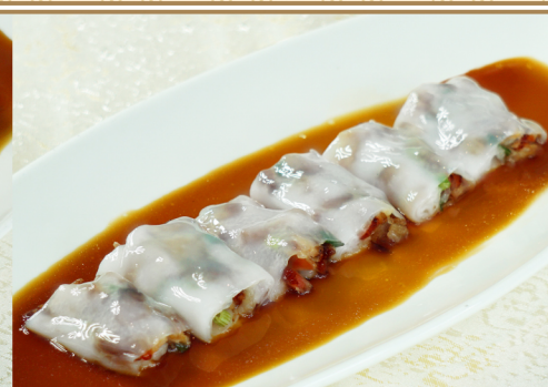
叉烧肠粉 Steamed Rice Roll with BBQ Pork