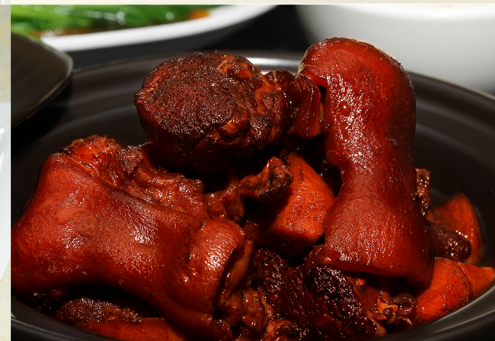
猪脚姜醋蛋 Pig Trotters, Ginger & Egg in Vinegar