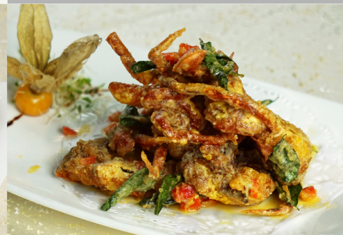
黄金软壳蟹 Soft-Shell Crab with Salted Egg York