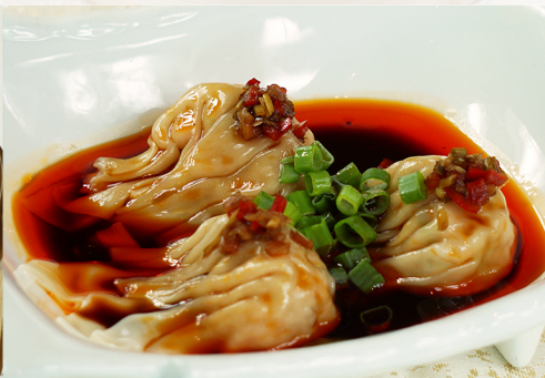
红油抄手 Sichuan Hot & Sour Dumpling